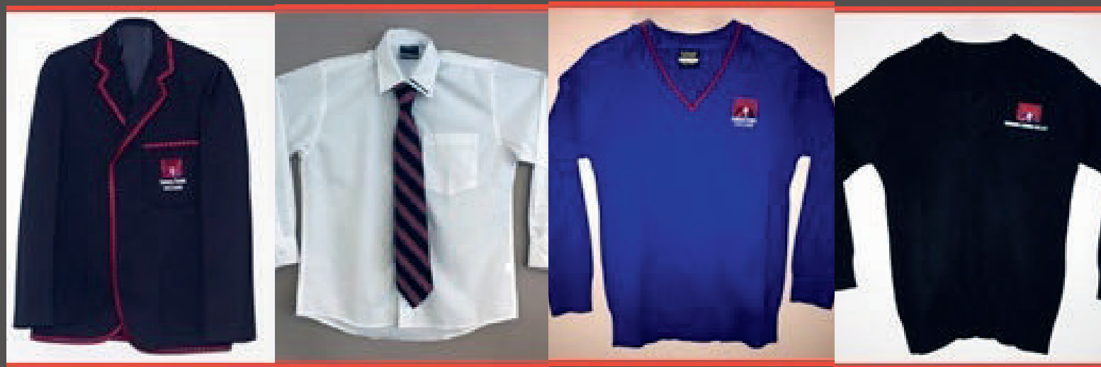
Left to Right: College Blazer, Long/Short Sleeved Shirt & College Tie, College Jumper (Blue), VCE Jumper (Black)