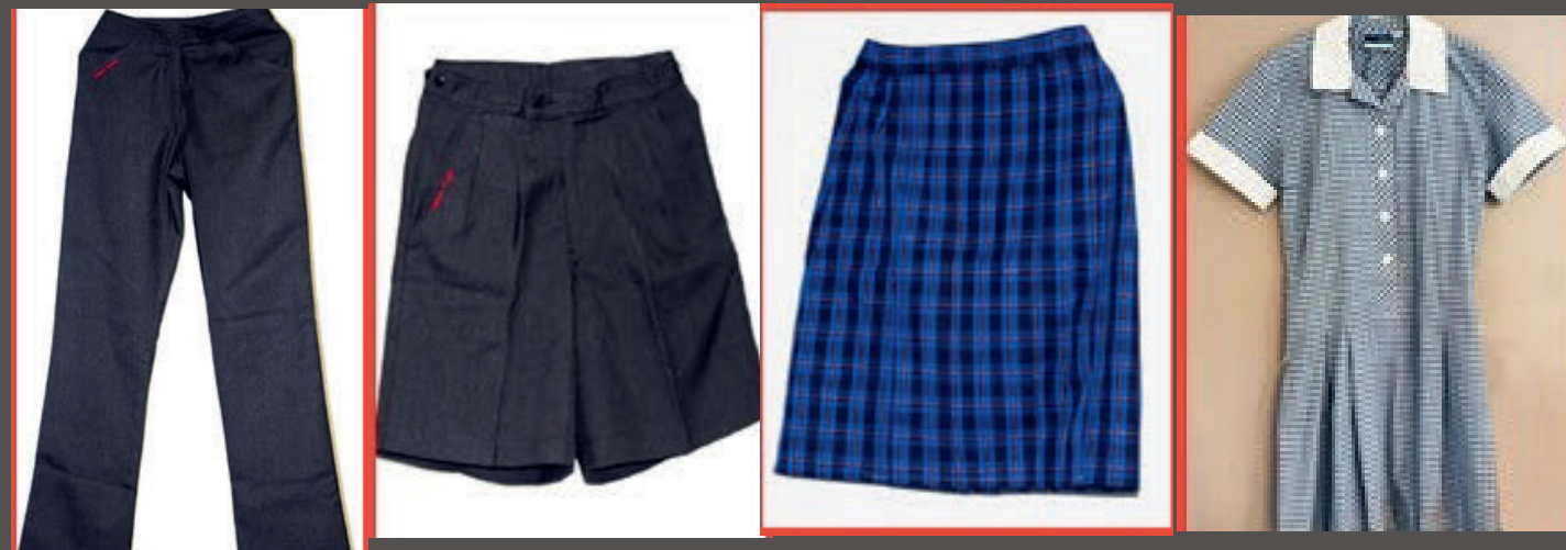
Left to Right: College Grey Trousers, College Grey Shorts, College Skirt, College Dress