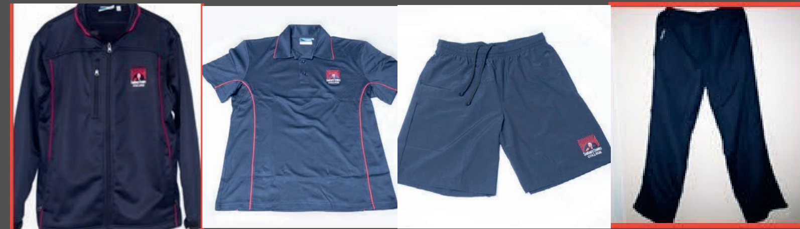
Left to Right: Soft Shell Jacket, Sports Shirt, Sports Shorts, College Track Pants